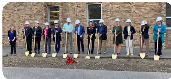
Groundbreaking of SCTCC's Advanced Manufacturing Training Lab

The GSDC team engaged with more than 500 business, government and community leaders, plus assisted with many business development