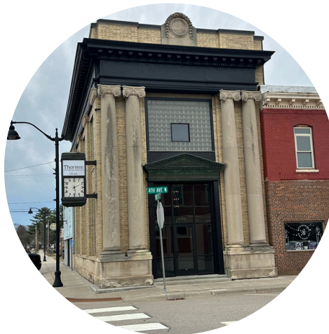
Facade improvements completed at 201 4th Ave. N. , Foley